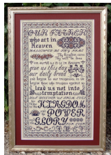
The Lord's Prayer