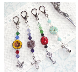
Lots of Sparkly Accessories

www.MyBigToeDesigns.com ~ PO Box 9566 Moscow, ID 83843 ~ 281-391-1415