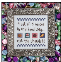
Eat the Chocolate!

This is a free design offered as a gift from My Big Toe Designs, and it may not be kitted or sold. After printing a personal copy, please only duplicate with needle and thread. Please direct your stitching buddies to www.MyBigToeDesigns.com to download the freebie, and so they can view our other items available! Thank you and God bless!