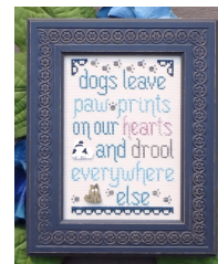
Dogs Leave Pawprints