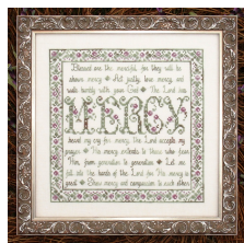
Building Block Series